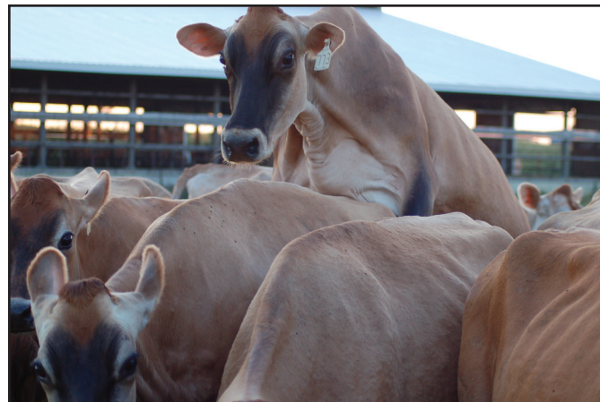
The average period of “standing heat” is usually less than 10 hours and consists of about one standing event per hour.

Traditionally, the cow that stands still and allows others to mount her is in “standing heat.” Standing is the primary sign of estrus. Ovulation usually occurs approximately 24 to 32